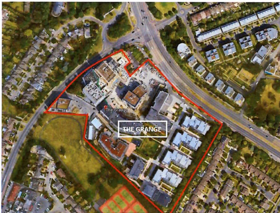
Figure 1: The Grange, Brewery Road, Stillorgan

Kennedy Wilson have property assets at 2 No. locations along the scheme. These are located at The Grange, Brewery Road, Stillorgan and at Cornerstone (former Leisureplex site), Lower Kilmacud Road, Stillorgan. Both properties are shown in Figure 1 and Figure 2 below.