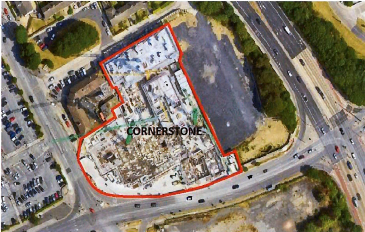
Figure 2: Cornerstone (former Leisureplex site), Lower Kilmacud Road, Stillorgan

The proposed scheme passes directly in front of The Grange which is an existing development of apartments and commercial units. There are existing access arrangements for set down, drop off, emergency vehicles and deliveries from the Stillorgan Road (see image in Figure 3 below). The current proposals for the Bray to City Centre Core Bus Corridor Scheme, as shown on Drawing No. BCIDB-JAC-GEO-GA-0013-XX-00-DR-CR-0023 Rev M01 and illustrated in Figure 4 below, do not appear to have any regard to the existing access arrangements. We would request that the existing access arrangements be maintained and that the scheme be amended appropriately.