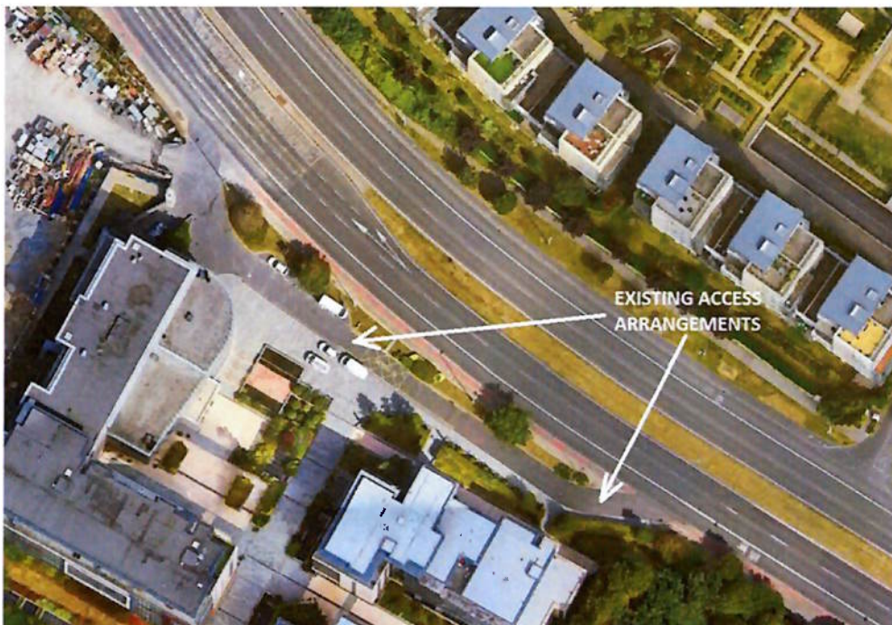
Figure 3: The Grange, existing access arrangements

The proposed scheme passes directly in front of The Grange which is an existing development of apartments and commercial units. There are existing access arrangements for set down, drop off, emergency vehicles and deliveries from the Stillorgan Road (see image in Figure 3 below). The current proposals for the Bray to City Centre Core Bus Corridor Scheme, as shown on Drawing No. BCIDB-JAC-GEO-GA-0013-XX-00-DR-CR-0023 Rev M01 and illustrated in Figure 4 below, do not appear to have any regard to the existing access arrangements. We would request that the existing access arrangements be maintained and that the scheme be amended appropriately.